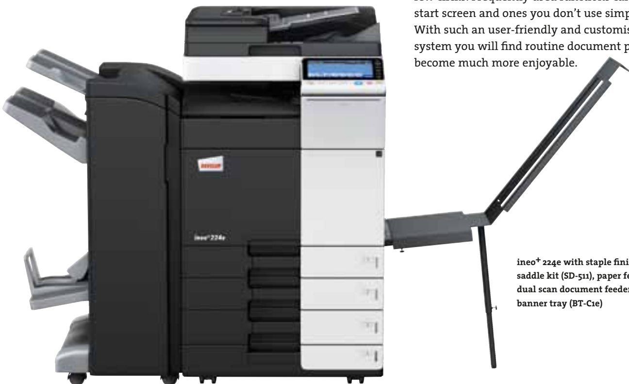
ineo+ 224e with staple finisher (FS-534), saddle kit (SD-511), paper feeder (PC-210), dual scan document feeder (DF-701), banner tray (BT-C1e)

Many multifunctional office systems are anything but user-friendly. The ineo+ 224e, in contrast, is simplicity itself. An intuitive, easily understandable operating concept ensures that it is as easy to use as your smartphone or tablet. The 9-inch capacitive touchscreen comes with familiar multi-touch operations such as flick, drag&drop and pinch in&out – so you will feel at home in this system in no time at all. Thanks to a new menu navigation structure you can see all functions in one go and select the settings you want with just a few clicks. Frequently used functions can be left on the start screen and ones you don't use simply removed. With such an user-friendly and customisable office system you will find routine document production jobs become much more enjoyable.