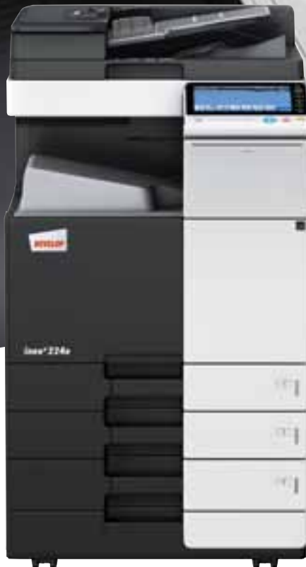
ineo+ 224e with paper feeder (PC-210) and dual scan document feeder (DF-701)